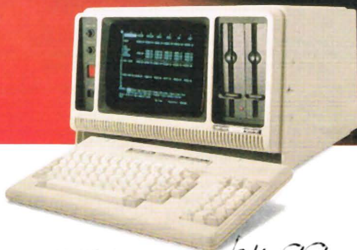
Model 4P Transportable Computer