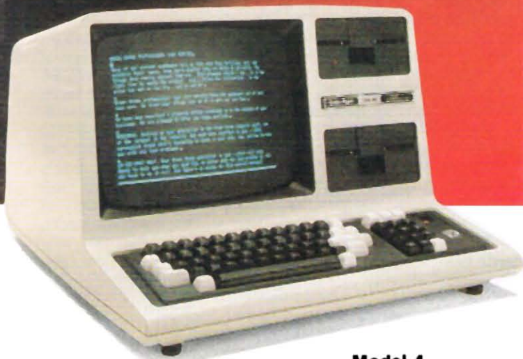
Model 4 Desktop Computer

A TRS-80® Model 4 for your office and a transportable Model 4P for the road!